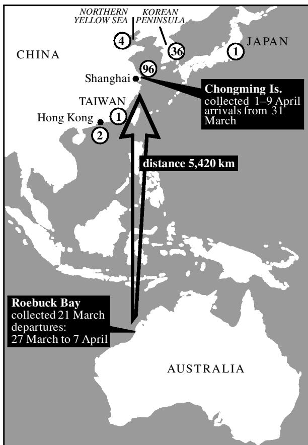
Figure 1. Flight route between Roebuck Bay, north-west Australia, and the Yangtze River estuary in China. Numbers in circles represent band recoveries or leg-flag sightings of great knots banded in north-west Australia.